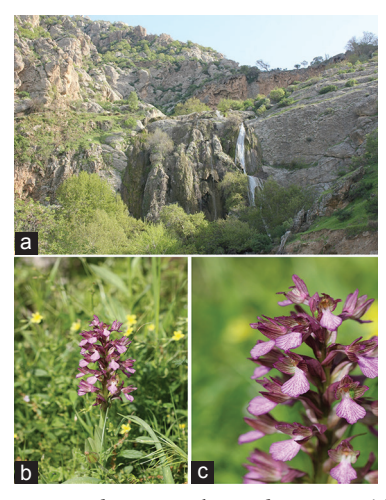
Fig. 2. Anacamptis papilionacea subsp. schirwanica; (a) Habitat, Silé waterfall locality, south aspect of Dostaka mountain, Akré province (Duhok governorate) Pseudosteppe grassland habitats in middle open Gall oak forest. (b) Habit. (c) Inflorescence. 09 April, 2016. (photos SamiYoussef).

In classical floras (for example, Flora of Turkey and Flora Iranica), this taxon was treated under the genus Orchis . Recently, this species has been proposed to be considered in the separated genus Anacamptis (Kretzschmar, et al., 2007; Véla and Viglione, 2015), but some others specialists propose to place it in another small genus Vermeulenia according to Löve and Löve (1972). Kretzschmar, et al. (2007) reported six subspecies mainly distributed in Mediterranean Region except one in Irano-Anatolian and eastern Caucasian Region A. papilionacea subsp. schirwanica is given for Azerbaijan and